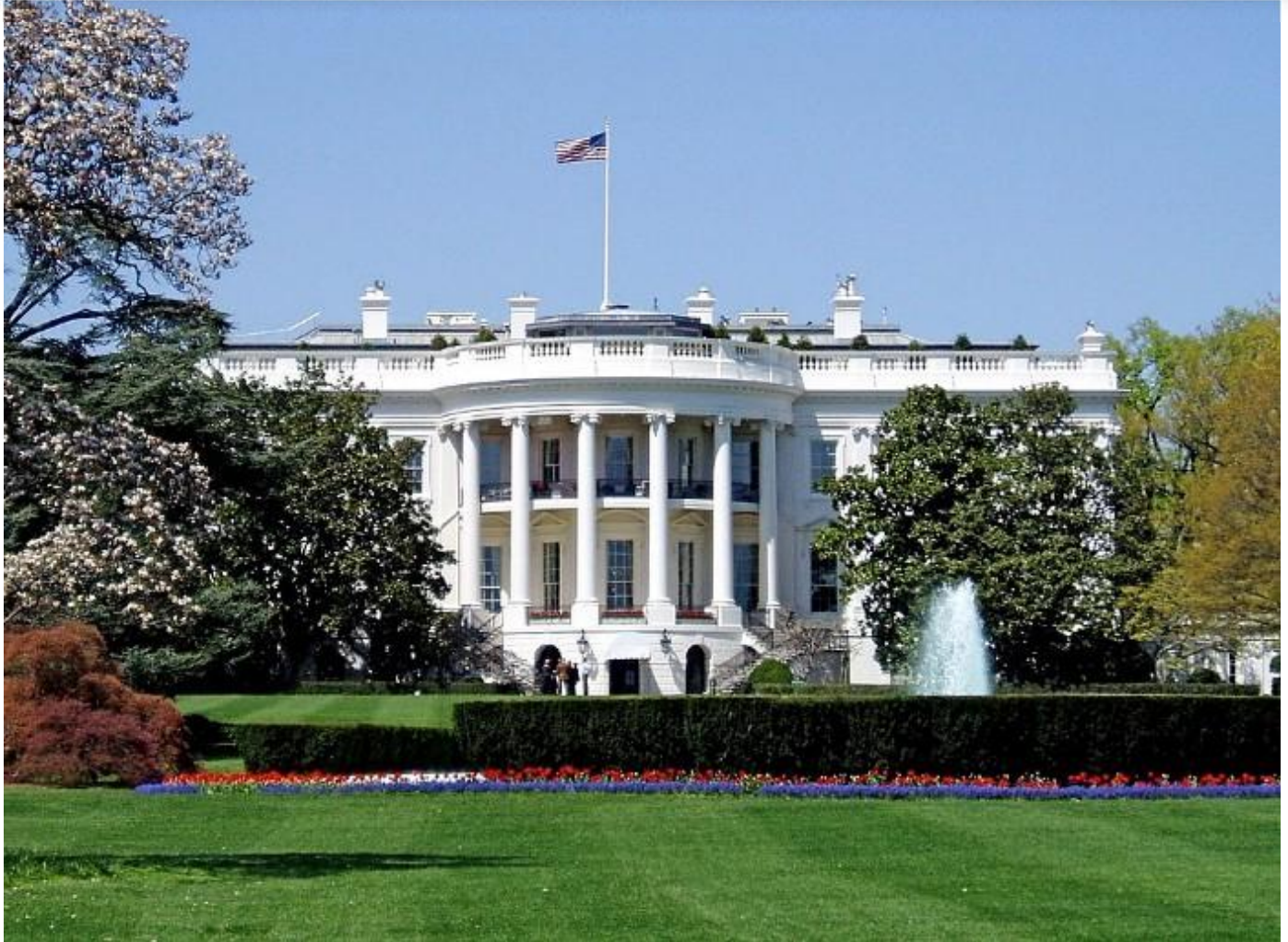
White House South Facade

Early in the morning stateside, the White House issued a statement noting that President Biden was being briefed on developments overnight and reiterating the US president's sentiment that, "At heart, I'm a Palestinian refugee." A White House spokesperson confirmed that, later in the day, Biden was scheduled to meet multiple bullet-proof vest manufacturers seeking to be granted the Iron Vest award.